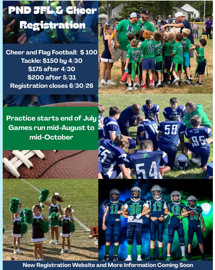
New Registration Website and More Information Coming Soon

Practice starts end of July Games run mid-August to mid-October