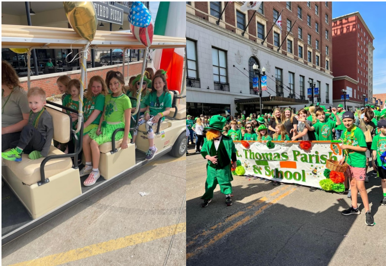
St. Patrick's Day fun at the parade!

We Teach Truth - Build Character - Inspire Service