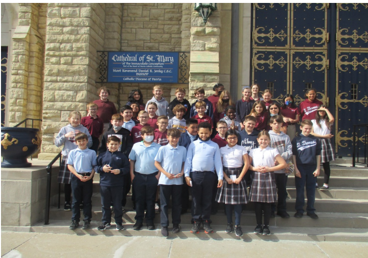
Grades 5/6 toured the Cathedral!