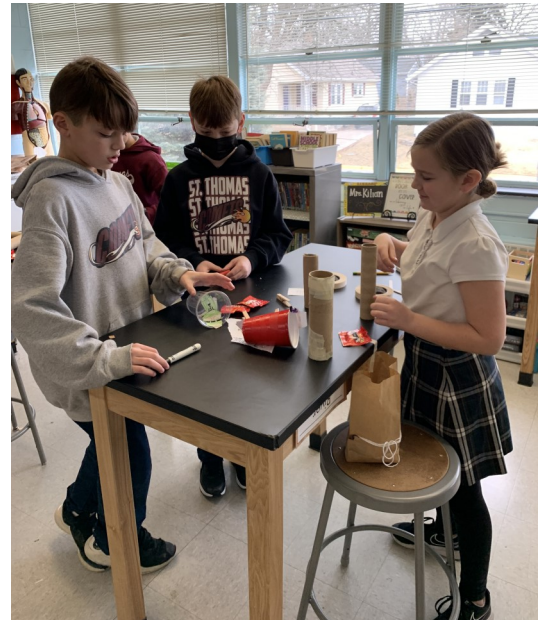
Fifth graders create traps for catching a leprechaun.

Order and payment deadline is March 21st.