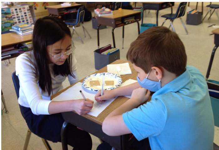
4th graders using frosting and graham crackers to study tectonic plates and earthquakes!