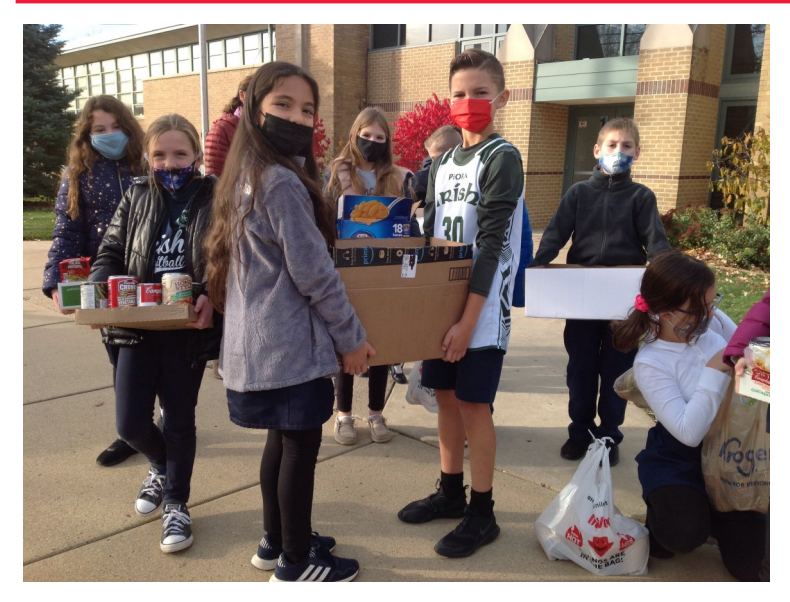
4th grade would like to thank you for participating in the food drive!