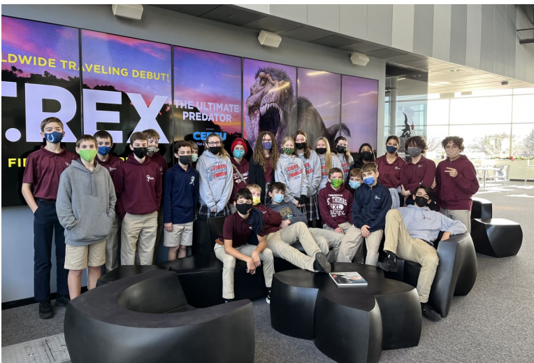
8th grade trip to the Riverfront Museum!

The screening dates for 2021/2022 school year will be: January 12th, 2022 with a rescreen date of January 25th, 2022.