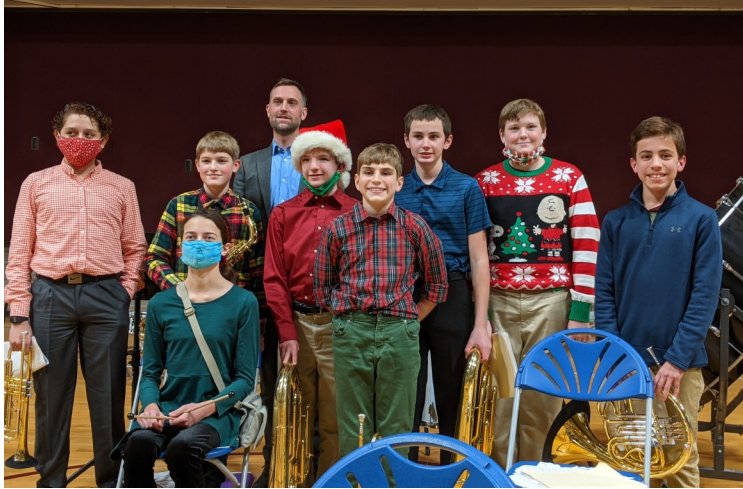
Eight 8th graders that delighted the audience with their band concert!!

Don't behave as you believe, you will end by believing as you behave. — Ft CLASS OF 2019