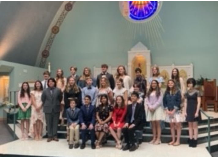
8th grade class—Mary Celebration