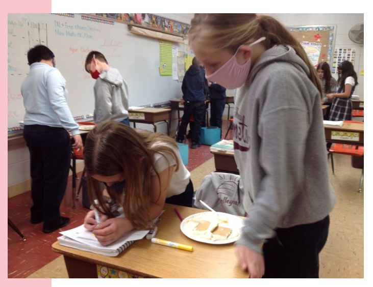
4th graders use frosting and graham crackers to study plate tectonics!