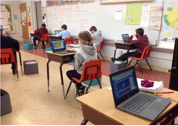
4th Grade loves their new computers!

We Teach Truth - Build Character - Inspire Service