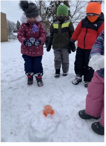
Pre-K theme on snow! Pre-K made snow volcanoes and even had a special snowman snack! It was SNOW much fun in Pre-K!