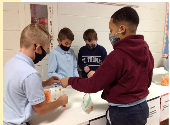
4th Grade STEAM project for Halloween Week!

Make a difference this holiday. Shop for gifts at smile.amazon.com/ch/37-0662587 to generate donations for St. Thomas the Apostle!