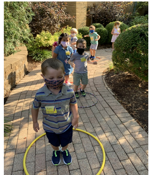
Preschool fun & alphabet letter hunt!